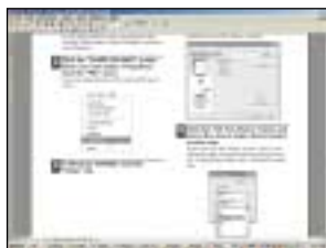
Printer Driver Screen