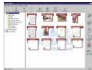
Complete document management on your PC with Sharpdesk